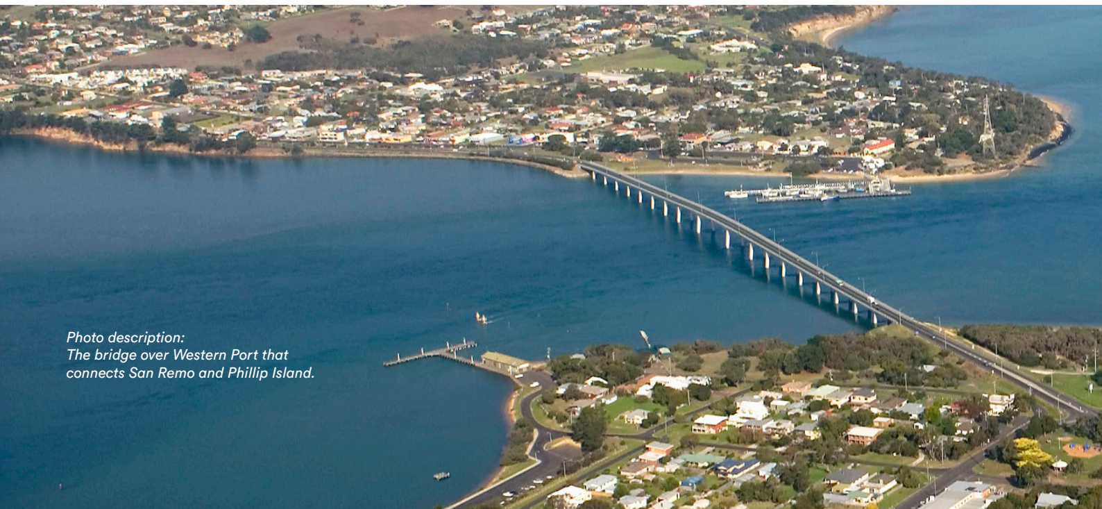
Photo description: The bridge over Western Port that connects San Remo and Phillip Island.

If Westernport Water provides a notice of rejection under section 3.1.2, it will also provide a statement of reasons for rejection at the same time.