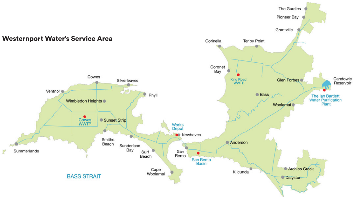
Figure 1: Westernport Water's Service Area