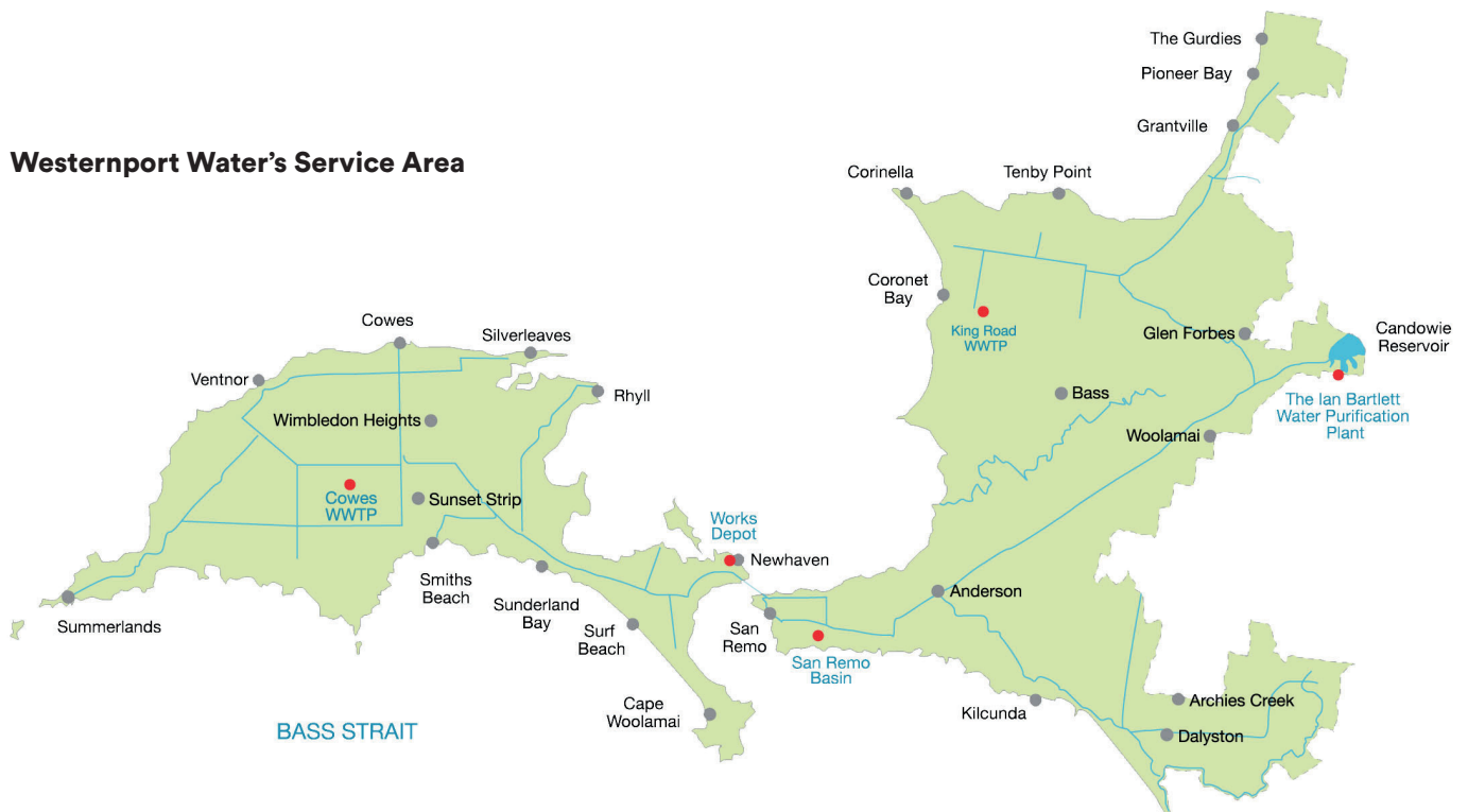
Figure 1: Westernport Water's Service Area