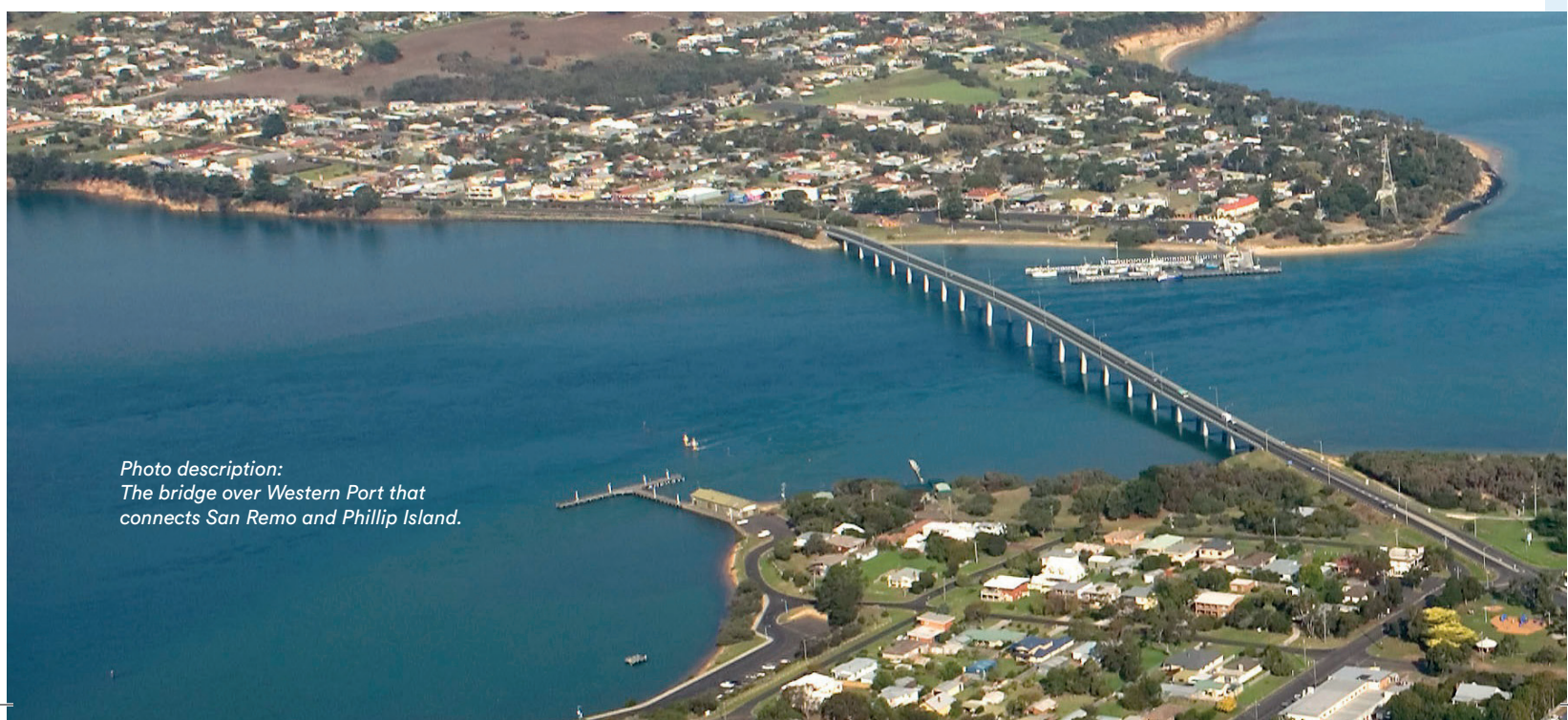
Photo description: The bridge over Western Port that connects San Remo and Phillip Island.

If Westernport Water provides a notice of rejection under section 3.1.2, it will also provide a statement of reasons for rejection at the same time.