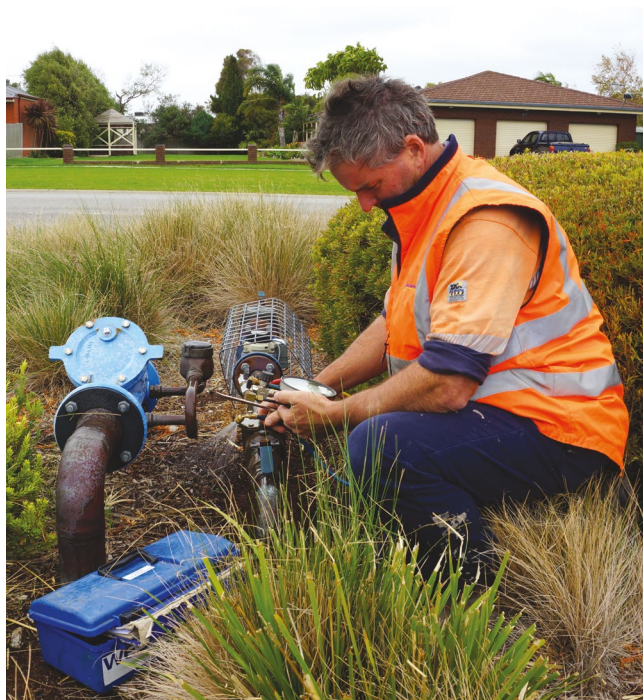
Backflow testing - Keeping our community safe.

To ensure the safety of the public drinking water network Westernport Water will be auditing and inspecting properties.