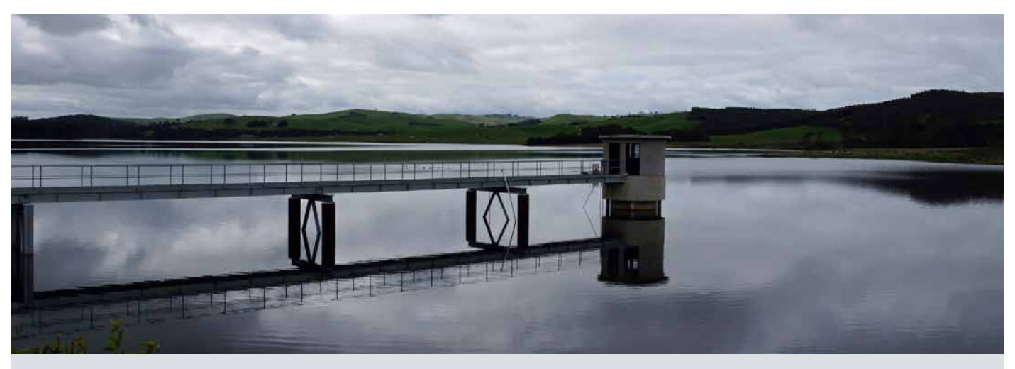
Candowie Reservoir Water Tower