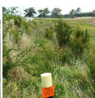
Candowie revegetation 2013-15