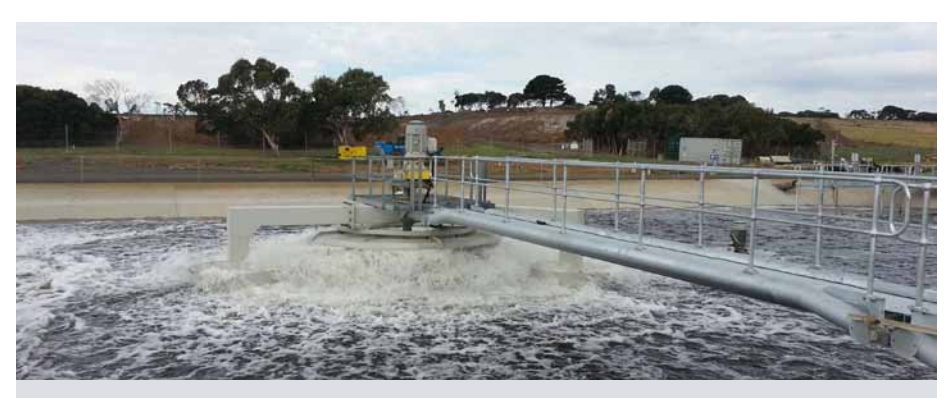
Cowes Wastewater Treatment Plant

Westernport Water has committed to pursuing community renewable energy options and has been approved as a member of the South Gippsland Community Energy Committee. The Committee will provide the governance and oversight necessary to select and establish community renewable energy projects in the South Gippsland region. The key mandate for this Committee is significant community consultation. Westernport Water will benefit from identification of potential shared renewable energy options with the community, as well as obtaining community and customer feedback to help guide Westernport Water's direction for the next planning period which commences in 2018.